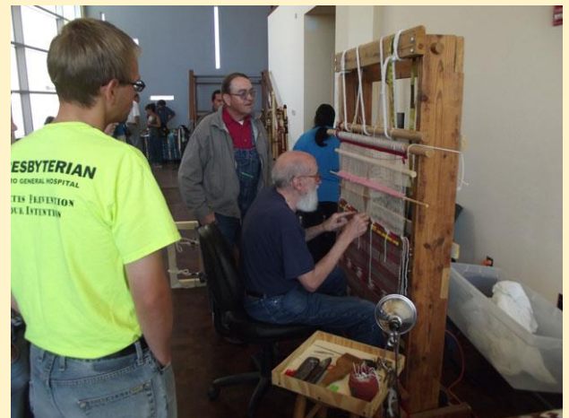
Weaving Demonstration – A skill that takes years of dedicated work to perfect