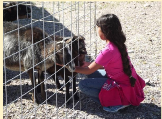
Churro sheep, first brought to New Mexico by Spanish settlers traveling on El Camino Real