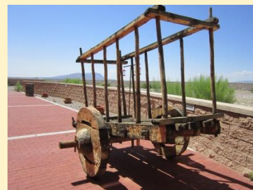
Replica of a Spanish Carreta – the heavy wooden cart used for carrying freight on El Camino Real.

First, going from left to right, is the United States flag, of course. Next is the flag of Spain, which ruled what is now a major part of the southwestern United States for over 200 years. In the center is the flag of Mexico, which took over the area after the 1821 revolution, holding it until the end of the Mexican-American War in 1848. The flag with the red Zia sun symbol at the center is the New Mexico State Flag. Finally, at the far right is the Texas State Flag, because the trail just barely passed through a small section of Texas where the trail crossed the Rio Grande at the present location of El Paso.