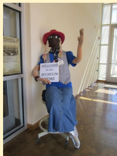
Camina, our friendly greeter and fashionista, welcomes visitors to the Museum Bookstore and Gift Shop

You probably notice that the general design of the shop is not much different from the way it looked before the repair work. That's because the long bank of large shelves simply will not fit anywhere else, and the checkout counter is tethered to power outlets and phone jack access. However, there are some small but major changes to the checkout area: We have more room! Just a few inches outward made a big difference in accessibility, space, and design. Plus an unknown power outlet was revealed, previously hidden behind a storage cabinet. Yea!! And, of course, the mess behind the wall is gone.